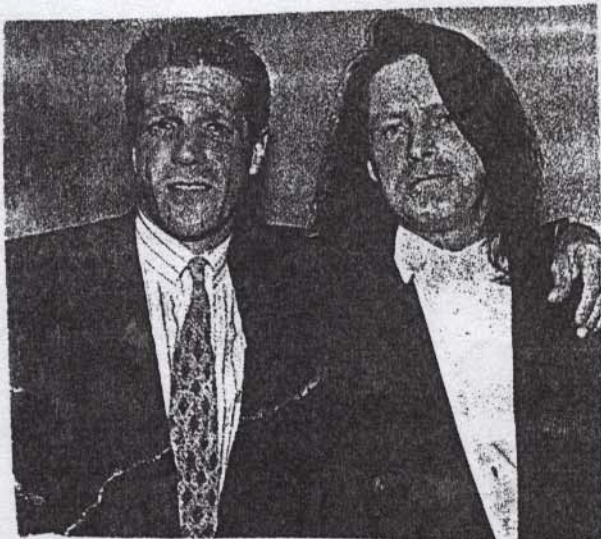
Don Henley and Glenn Frey at a benefit for MUJATH (musicians joined at the hip).