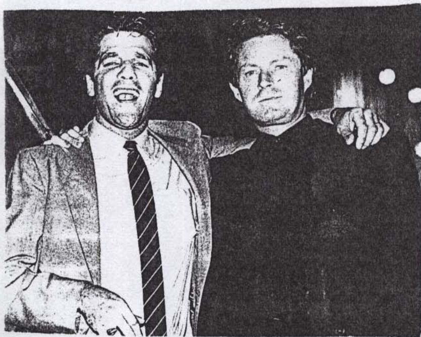
"I can't wait to have the bathroom for myself" said Glenn Frey of his soon-to-be separation surgery.

Doctors at Cedars Sinai hospital are pleased to report that Glenn Frey and Don Henley have been successfully separated. The two musicians and co-founders of the 70s supergroup The Eagles have been joined at the hip since a freak accident in the late 70s. The two stumbled into a sample of radioactive waste at a No Nukes concert. The waste was meant to be used as an example of the evils of nuclear power, but instead, worked as a powerful bonding agent. The surgery ends years of fighting over women and bathroom use. Both are said to be resting comfortably.