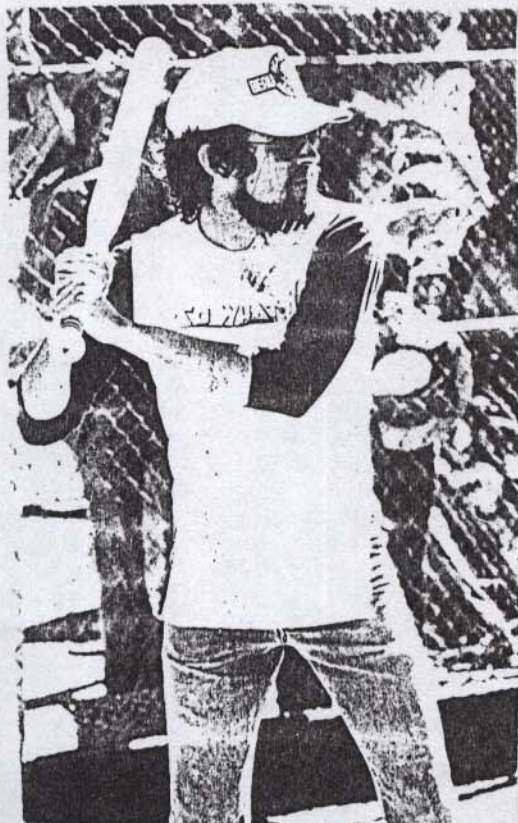
Just pretend it's the AP, Don. Swing away.