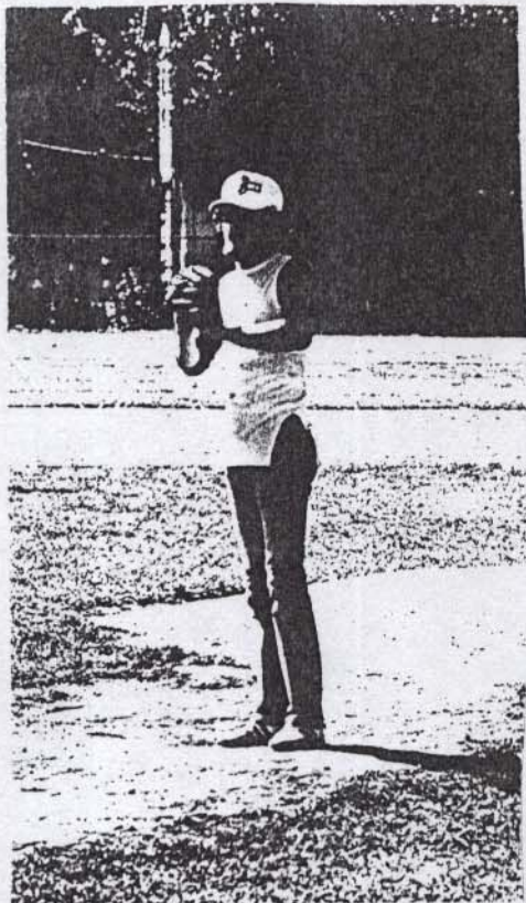
Pitcher Don Henley gets ready to throw his renowned Eco-Ball. It's smeared with birch sap.

This summer, the Eagles have taken to the field to provide entertainment to those who thrive on baseball. "It took a little while to get in shape again," groaned Don Henley rubbing his back and sucking on an Evian bottle, "but it was worth it." So far, the Eagle record is 2-0, having beaten the Saved by the Bell team and trouncing Jason Priestly's 90210 team.