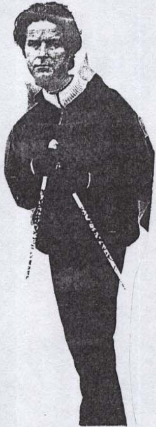
Don Henley hits the Aspen slopes donned in the latest ski outfit.