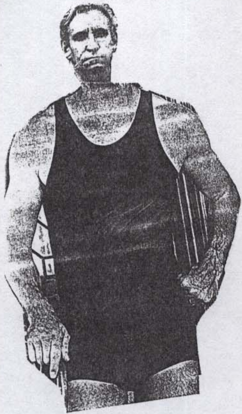
Joe Walsh, after taking Glenn Frey's Living Right advice, models trendy workout wear.

We've gotten the Eagles to model some of the newest fashion trends.