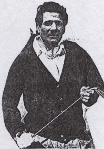
"fore!" Athletic Glenn Frey shows us his golfing gear.