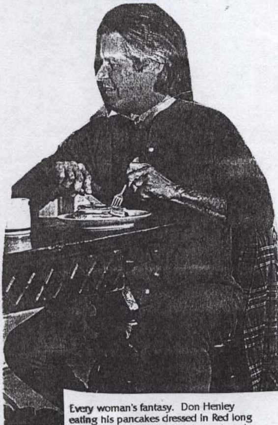
Every woman's fantasy. Don Henley eating his pancakes dressed in Red long underwear. EEEEEK!!! What's that hanging on the back of the chair.