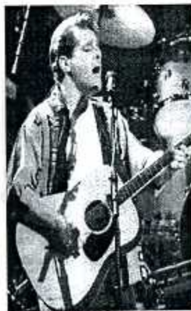
What? No Italian sunglasses this year?

Here's hoping they all got enough plaid flannel shirts to take them on another American Tour!