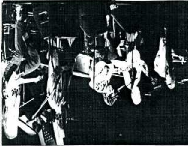
The show in Brisbane had an Australian feel to it. Imagine the hair gel used to keep every lock in place

Glenn started us off by saying, "Yes, we're those darned Eagles" and then it was straight into "Hotel California" (we'd taken bets on what the first song would be and although I had gone for "Take it Easy" I had had a look in the Wasted Times and the odds defiantly appeared to be against me). It lived up to everyone's expectation but didn't go on as long as the version on the 1980 Eagles Live album. They decided to do the concert in two parts, 8pm to 9pm and then 9:30pm to 10:30pm. "One of These Nights" got our vote as the best song in part one.