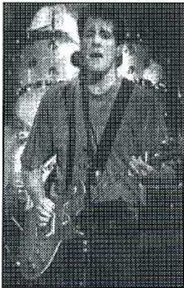
"Oh man, my gut really hurts."